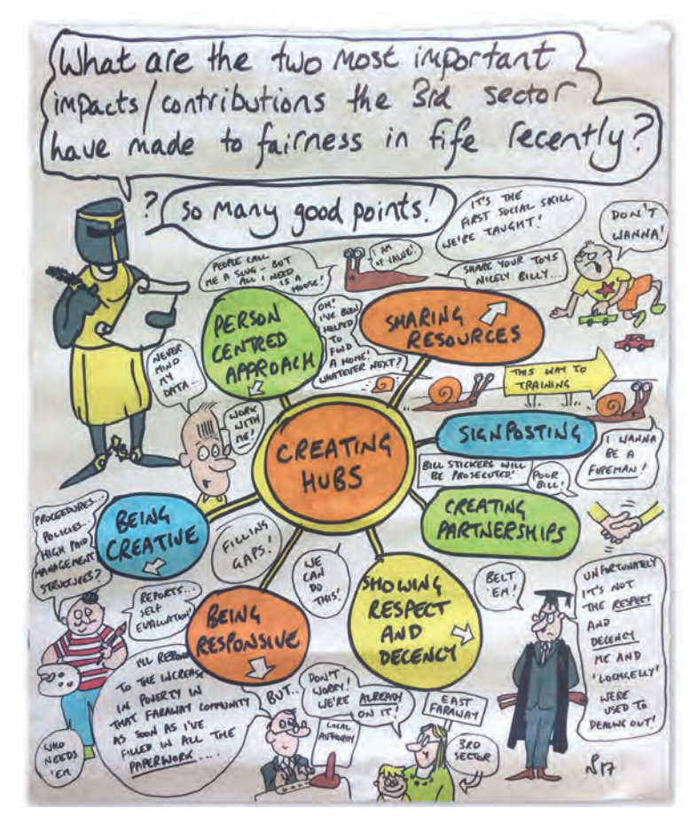
Graphic recordings The others can be seen on pages 26 - 33

Start in fairness; small, critical and focused. Give voice to the tears Feel the frustration, feel the gap and feel the potential.